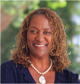
Senator Holly Mitchell California State Senate 30th Senate District