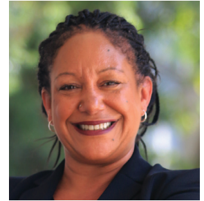
Cat Brooks 2018 Candidate for Mayor of Oakland