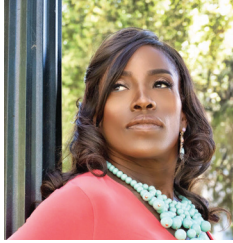
Ruthie Bolton Olympic Gold Medalist and Former Star Player for the WNBA's Sacramento Monarchs Health, Sports & Wellness

Sac Cultural Hub Media Foundation is proud to present the 2018 Honorees with the EWOC Excellence Awards