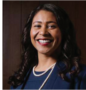
Mayor London Breed City of San Francisco