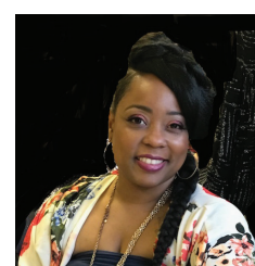
Timiza Wash Anti-Trafficking Program Manager Weave Presidential Excellence

See feature stories on the 2018 EWOC Honorees in the Fall issue of THE HUB Magazine